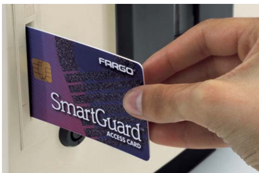
Stop unauthorized card printing with SmartGuard™ Printer Security. This exclusive Fargo feature controls access to your system by allowing only authorized users with an access card, or "key", to print cards.

Designed to make you and your cards look their best, the DTC500 Series features the finest quality and most versatile direct-to-card (DTC®) printing available. Each model prints edge-to-edge on standard CR-80 cards from 10 mil to 50 mil thick, and consistently produces crisp, full-color or monochrome cards.